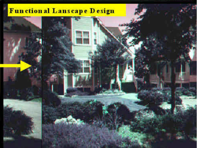
Functional Landscape Design